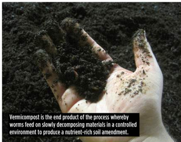
Vermicompost is the end product of the process whereby worms feed on slowly decomposing materials in a controlled environment to produce a nutrient-rich soil amendment.

The feedstock or initial organic matter in the compost has a large impact on the finished product. The initial nutrient levels will