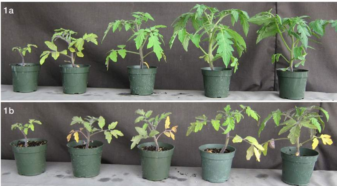
Photos 1a and 1b. Tomato transplants grown in dairy solids vermicompost (A) and sawdust-based vermicompost (B) added to a peat/perlite substrate at rates of (L to R) 0%, 5%, 10%, 20% and 30% by volume.

In summary, if you're intending to add vermicompost to your container substrates, we recommend testing early and often. Work with your vermicompost supplier to understand their material and recommendations for using it in container production, then be sure to monitor the pH and EC of your substrate before planting and during production. We recommend that growers make small batches of vermicompost containing substrates and that they test them under their own growing conditions. GT