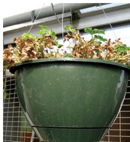
Figure 6. Check your heaters frequently as faulty heaters can release ethylene and damage sensitive crops such as geraniums. Catching a problem early will make treatment much easier and will reduce the number of plants affected.

Once your plants reach the retail environment, it is essential they are provided with adequate environmental conditions to sustain photosynthesis. Low light levels and warm temperatures in post harvest will lead to leaf and flower senescence and overall poor quality. Likewise, low light levels and excessively cold temperatures are detrimental for crops such as poinsettias, orchids, and tropical plants. Ethylene is also a factor that