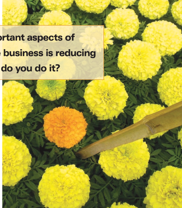
Figure 1. Shrinkage may occur when cultivars do not germinate true to type from seed.

At 10 percent shrink (about the average at retail), Dick and Jane will realize a net profit of only $200. At 20 percent shrink, they will lose money on the crop. Shrink works against us in two ways – it raises the cost that it took to produce each saleable container, and it reduces the number of containers we