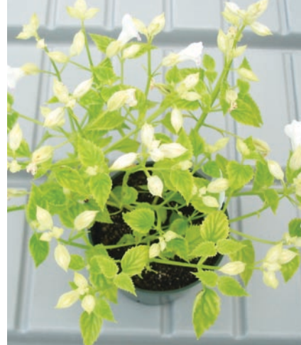
Figure 5. The loss of plants due to diseases, insects, nutritional deficiencies or toxicities and ethylene also contribute to shrink.

Assuming you have minimized your propagation and production