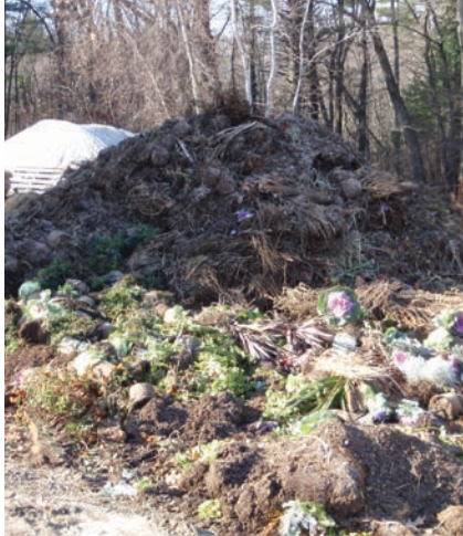
Figure 4. Adding in extra weeks as a "cushion" will cause you to miss your target date or produce plants that will be overgrown and lower quality – both making your compost pile grow.

Look at the plants themselves to identify insects, mites and the damage they cause. Record observations and review these regularly to identify any trends in infestations. Don't get tunnel vision when scouting for insect pests, look for disease and nutritional