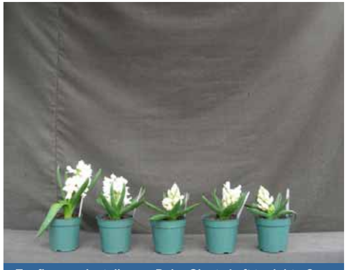
Topflor preplant dips on Polar Giant. Left to right: Control, 20 ppm Topflor for 10, 30, 60, or 120 minutes. 2007. Image 0307.

Since 1999, we have conducted numerous trials on pre-plant dips with hybrid lilies with Bonzi, Sumagic and Topflor. As is apparent from the extensive information on the annual CD, there are large cultivar differences in response to PGR dips, overall, and the specific response to Topflor will also vary by cultivar. In most cases, the Topflor rate we have chosen for experimentation have been too high, as seen in the photos below, where the "right" rate is lower than our lowest tested rate.