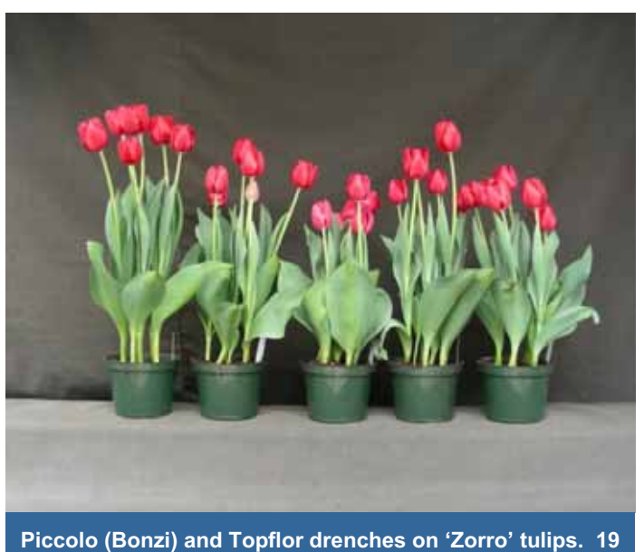
Piccolo (Bonzi) and Topflor drenches on 'Zorro' tulips. 19 cold weeks, housed 15 March. 2004. L to R: Control, 1 or 2 mg/pot Piccolo drench, 0.5, 1 mg/pot Topflor drench. Image 2385.