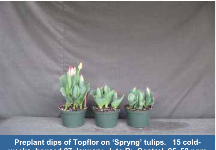
Preplant dips of Topflor on 'Spryng' tulips. 15 coldweeks, housed 27 January. L to R: Control, 25, 50 ppm dips for 10 minutes. Clearly, an overdose, and lower concentrations are needed. Image 1312.