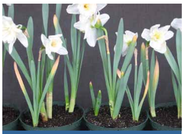
Example of Topflor phytotoxicity seen by the end of flowering resulting from lengthy, high concentration Topflor dips. Image 0420.