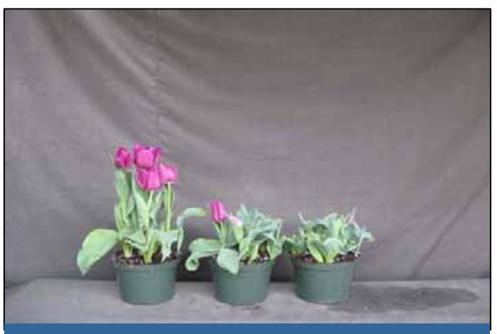
Preplant dips of Topflor on 'Passionale' tulips. 15 coldweeks, housed 27 January. L to R: Control, 25, 50 ppm dips for 10 minutes. Clearly, an overdose, and lower concentrations are needed. Image 1298.