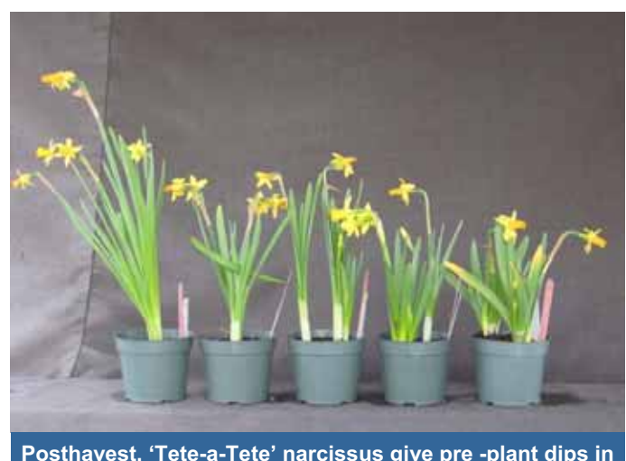
Posthavest. 'Tete-a-Tete' narcissus give pre -plant dips in 50 ppm TopFlor for L to R: 0 (water control), 10, 30, 60, or 120 minutes. Image 0267.

We have seen examples of phytotoxicity from lengthy, high concentration Topflor dips, especially in Tete-a-Tete. The rate suggested, 50 pm for 10-30 minutes, has been safe in our trials (see photos).