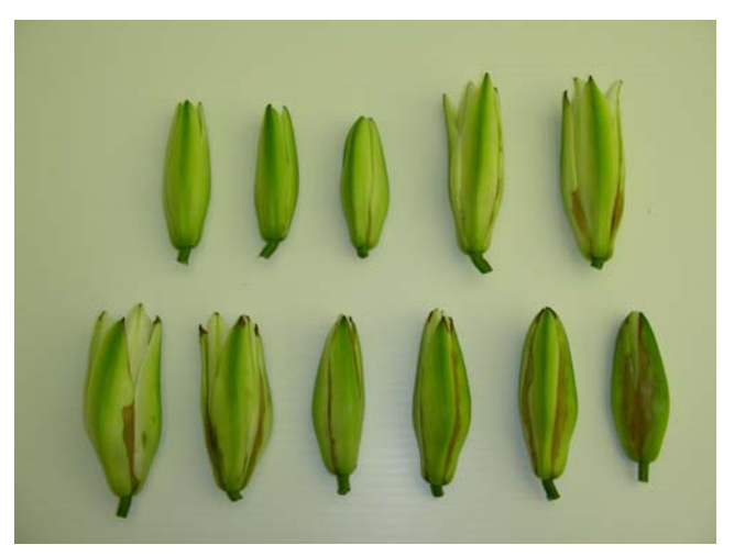
Fig. 3. Various stages of bud necrosis on 'Mona Lisa' buds. Top, left to right: No necrotic lesions (0%) to 40% necrosis along the tepal. Bottom, left to right: 50 to 100% necrosis along the length of the bud. Any rating greater than 2 (necrotic area longer than 1 cm around the tepal fringe; middle bud on the top) is noticeable and considered unmarketable.