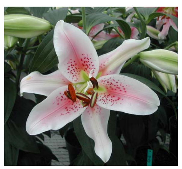
Fig. 2. Bud necrosis affects many Oriental hybrid lilies such as 'Mona Lisa'.