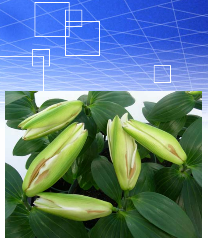
Fig. 1. Bud necrosis on 'Mona Lisa' lilies.