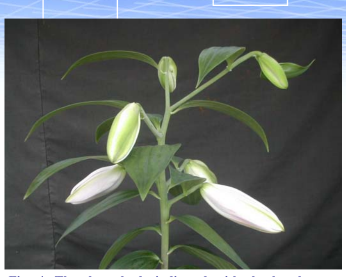
Fig. 4. The three buds indicated with the bracket are particularly susceptible during cold storage. These buds are actively growing at the time of cold storage and sudden temperature drop in cold storage can induce severe bud necrosis.