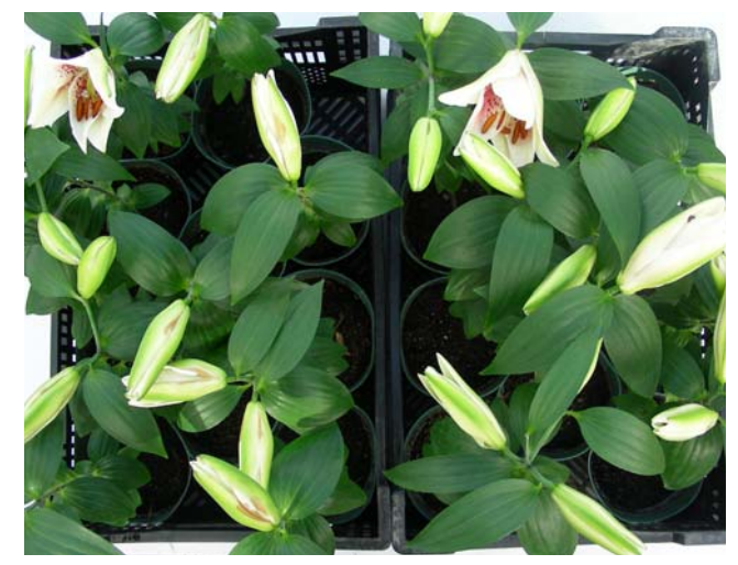
Fig. 6. Using heavy shade cloth (85%) can greatly reduce bud necrosis in 'Mona Lisa' lilies. All of the plants were grown at 26C and moved directly to 3C cold storage. Top, left to right: grown in full sun (control), under 55% shade cloth, or 85% shade cloth for a week before cold storage. Bottom: Close-up of the upper part of the plants. Left, grown in full sun (control); right, 85% shade cloth for a week before cold storage.

Fig. 5. Two days acclimatization at 7C can reduce bud necrosis in 'Mona Lisa' lilies. All plants grown at 26C in the greenhouse. Top, left to right: held at 3C cold storage (control), acclimatized at 7C for 2 days before moving to 3C, or held at 7C. The acclimatization (7C to 3C) and warmer (7C) storage treatments greatly reduced bud necrosis. Storage at 7C, however, allowed further growth of the buds, resulting in unwanted flowering during cold storage. Bottom: Close-up of the upper part of the plants. Left, held at 3C cold storage (control); right, acclimatized at 7C for 2 days before moving to 3C.