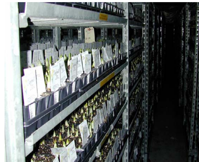
Example of rooting room stage for bulbous plants grown in cell-packs, for eventual commercial landscape or garden use. Image 4540.

To fully exploit such a concept, we will ultimately need more information about bulb storage, health and quality. Given our current techniques, there is a limit on how long a tulip bulb may be held in warm storage before cooling. Diseases and loss of rooting and overall vigor take their toll. Possibly, information learned from the explosion in hydroponic tulip production can be adapted, but it is likely other research will need to be conducted at PPO or Cornell to fully solve the problems. One can imagine an important role for 1-MCP (Ethylbloc in the US) for longer storage outside of the EU.