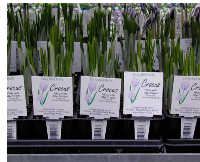
Examples of crocus, in cell packs, ready for spring sale, and direct planting into the outdoor landscape.