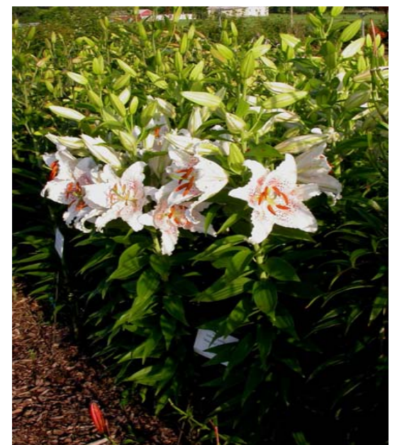
'Muscadet' plants in third flowering year, Ithaca NY (zone 5). Image 1768.

Muscadet (14/16 cm). Leaves show typical interveinal yellowing (as with iron deficiency chlorosis). No leaf spotting. Stems sturdy, light green. No side shoots.