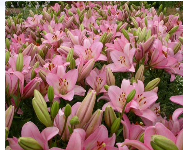
'Samur' flowers from the same plot. Third year flowering, Ithaca NY. Image 1635.

It is important to know the cultivars that are being grown. Most cultivars showed no differences in stem length over the three different planting dates. However, 'Acapulco' had longer stems as the planting date was extended and 'Farolito', 'Rodolfa', 'Samur', 'Stanza Zanlanza', and 'Star Gazer' had shorter stems as the planting date was extended.