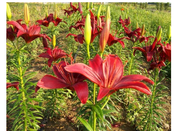
‘Monte Negro’ hybrid lily in outdoor cut flower experiments on Long Island, New York.