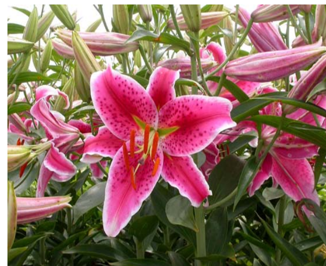
View of 'Star Gazer' flower density from above plot. Image 1899.

Ceb. Dazzle (14/16 cm). Excellent plant vigor. Main plants with 15+ buds. Many side shoots present, each with 4-6 flower buds each. Leaves light green. Stems dark-striped.