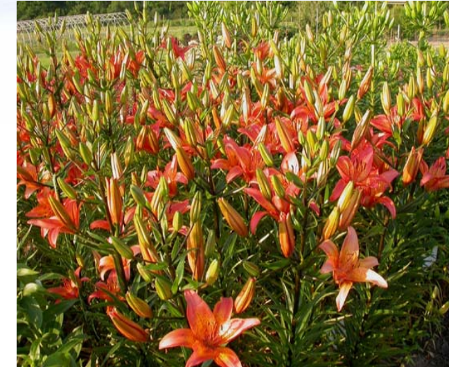
'Colosseo', Ithaca NY, full flower. Note dark stems, and contrast with the flowers. Image 1472.

Tom Pouce (14/16 cm). Enormously thick stems, and very sturdy plants. No side shoots.