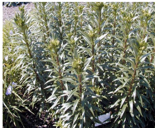
‘Samur’ LA-hybrid lily, bud stage, Ithaca NY. Image 2808.

Samur (14/16 cm). Good quality leaves, very few leaf spots on them. Stems very strong.