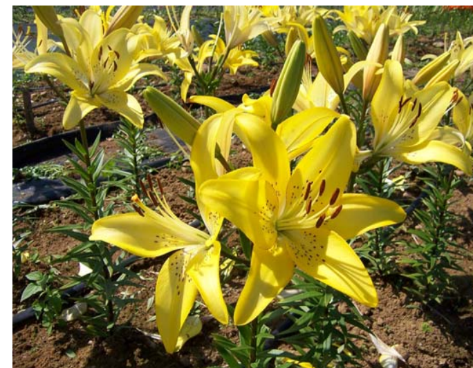
‘Dazzle’ hybrid lily in outdoor cut flower experiments on Long Island, New York.

Some of the best cultivars with good flower stem length and strength, nice flower bud number per stem, and overall performance of 4.5 or higher were: ‘Acapulco’, ‘Algarve’, ‘Castello’, ‘Ceb Dazzle’, ‘Conca d’or’, ‘Fangio’, ‘Laguna’, ‘Red Alert’, ‘Royal Fantasy’, ‘Royal Trinity’, ‘Samur’, ‘Sorpresa’, ‘Springfield’, ‘Stanza Zanlanza’, ‘Starfighter’, ‘Tresor’, ‘Triumphator Zanlophato’, and ‘Val di Sole’.