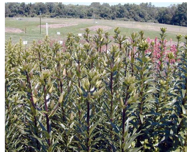
Plot of 'Colosseo' Asiatic hybrid lily in Ithaca NY. Just before flowering. Image 2845.

Colosseo (12/14 cm). A striking plant when grown outdoors. Very dark, almost black stems, throughout the whole length, including the bud stems (pedicels). This characteristic is related to light and cool temperatures, and is a characteristic that could be selected for in "garden" lilies. Nearly as tall as 'Fangio'. Leaves of good quality, with just a few spots. Plants has a moderate number of side shoots.