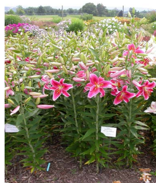
'Star Gazer' plants, third year flowering in Zone 5, Ithaca NY. Image 1898.

Stargazer (12/14, 14/16, and 16/18 cm). Some of the plants showed upper leaf necrosis (ULN), as is commonly seen in greenhouse-grown plants (from large bulbs). Foliage was a bit rough, bronzy, but generally dark green. In the first two years, there were noticeable differences in growth between the three sizes, but not by the third year.