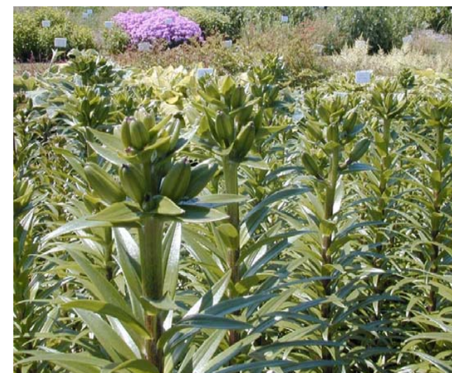
Close-up of 'Tresor', in the third flowering season. Note stem diameter, sturdiness, and bud count. Image 2818.

Tresor (14/16 cm). Very sturdy stems "like Redwood trees". Stems dark, but not in the area immediately around the buds. Good leaves.