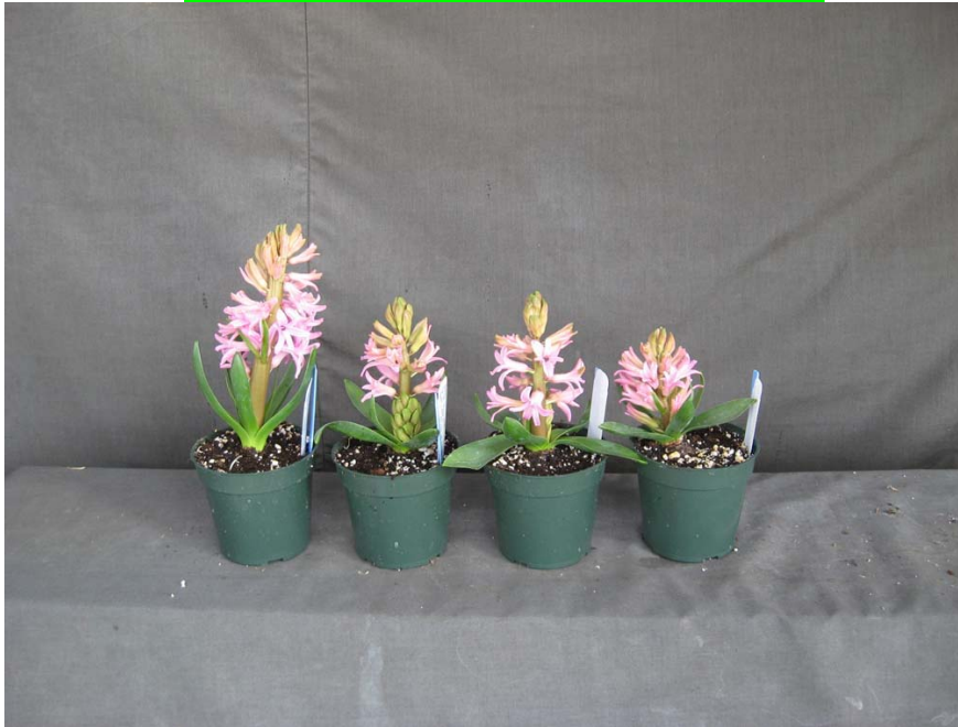
Pink Pearl. Left to right: Control, 40 ppm Topflor dips for 10, 30 or 60 minutes. Expt. 2009-H1, Set 1. Image 0970.