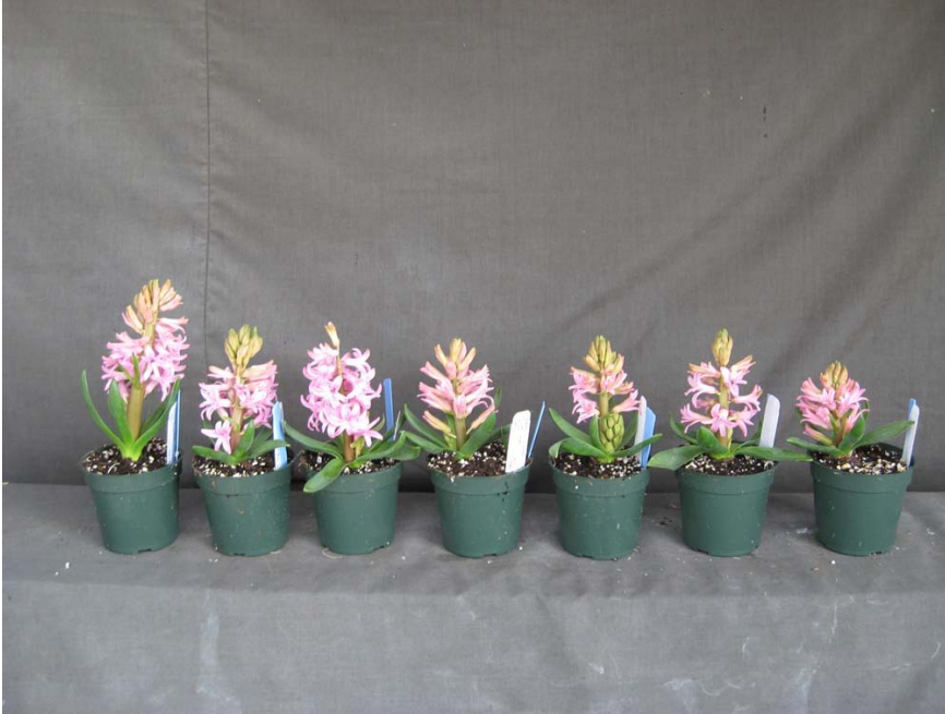
Pink Pearl. Left to right: Control, 20 ppm Topflor dips for 10, 30 or 60, minutes; 40 ppm Topflor for 10, 30 or 60 minutes. Expt. 2009-H1, Set 1. Image 0966.