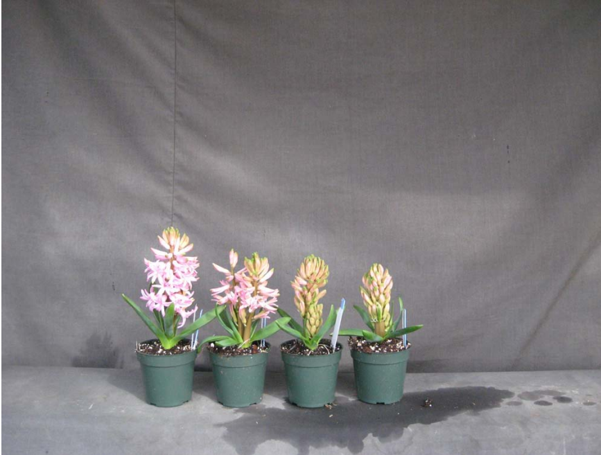
Pink Pearl. Left to right: Control, 40 ppm Topflor dips for 10, 30 or 60 minutes. Expt. 2009-H1, Set 2. Image 1550.