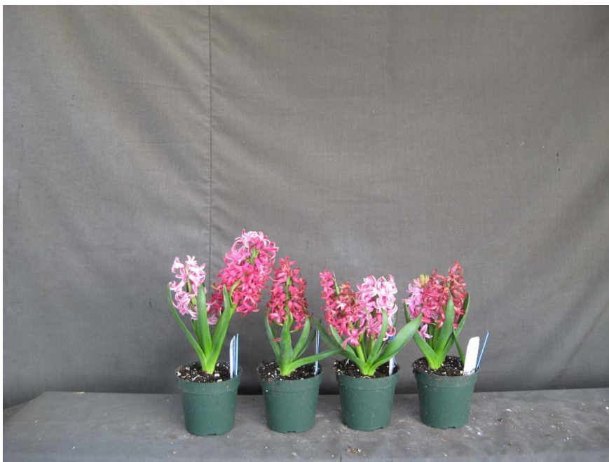
Pink Pearl. Postharvest. Left to right: Control, 20 ppm Topflor dips for 10, 30 or 60 minutes. Expt. 2009-H1, Set 1. Image 1243.