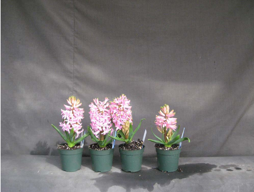
Pink Pearl. Left to right: Control, 20 ppm Topflor dips for 10, 30 or 60 minutes. Expt. 2009-H1, Set 2. Image 1549.