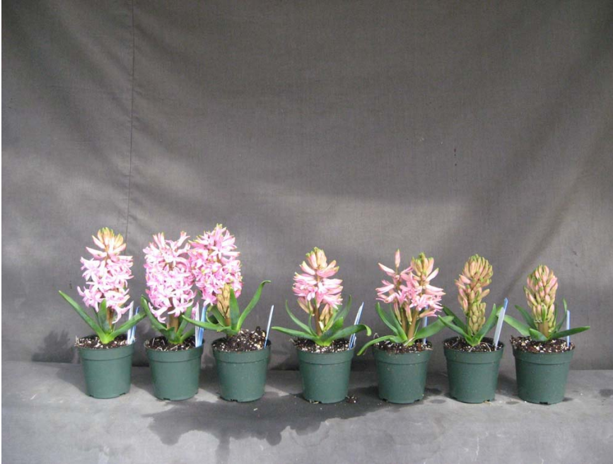
Pink Pearl. Left to right: Control, 20 ppm Topflor dips for 10, 30 or 60, minutes; 40 ppm Topflor for 10, 30 or 60 minutes. Expt. 2009-H1, Set 2. Image 1548.