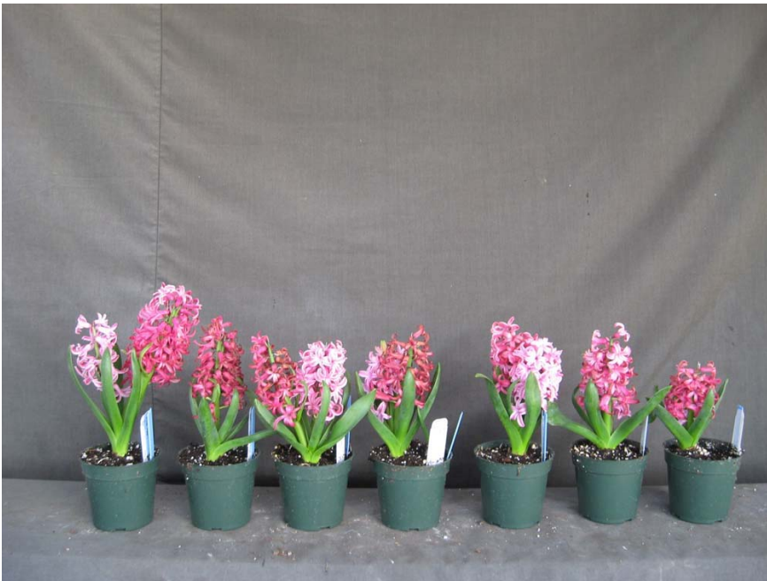
Pink Pearl. Postharvest Left to right: Control, 20 ppm Topflor dips for 10, 30 or 60, minutes; 40 ppm Topflor for 10, 30 or 60 minutes. Expt. 2009-H1, Set 1. Image 1242.