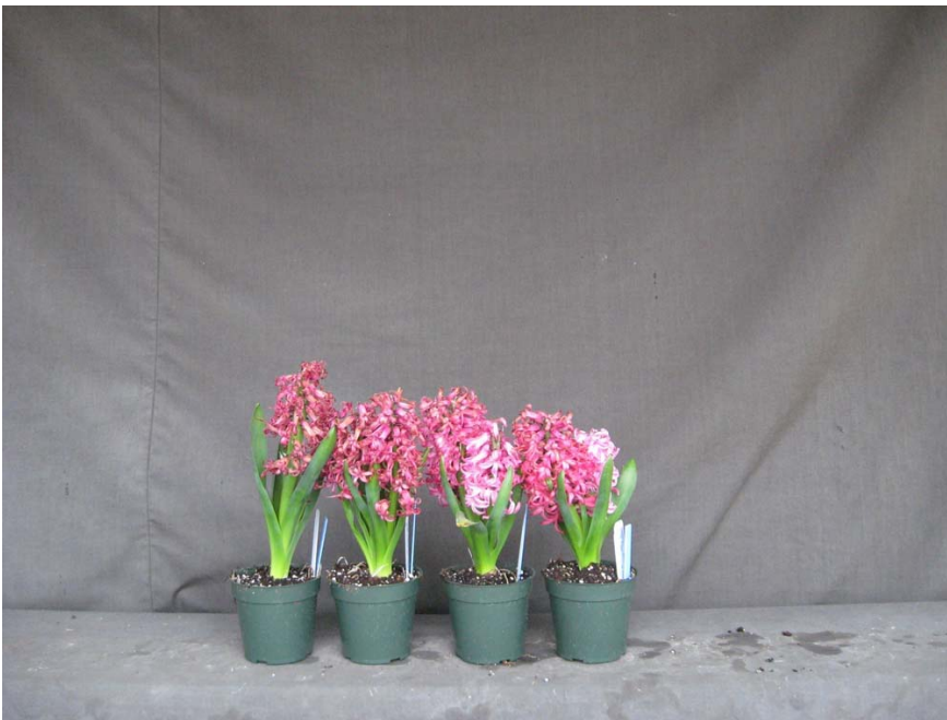
Pink Pearl. Postharvest. Left to right: Control, 40 ppm Topflor dips for 10, 30 or 60 minutes. Expt. 2009-H1, Set 2. Image 1739.