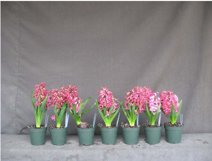
Pink Pearl. Postharvest Left to right: Control, 20 ppm Topflor dips for 10, 30 or 60, minutes; 40 ppm Topflor for 10, 30 or 60 minutes. Expt. 2009-H1, Set 2. Image 1737.