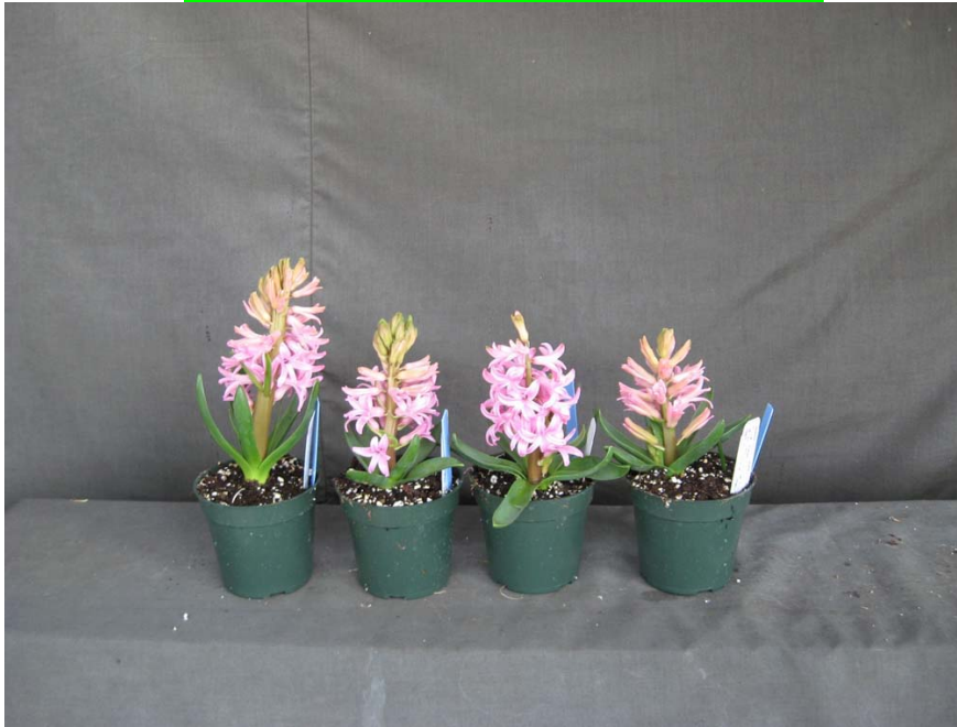
Pink Pearl. Left to right: Control, 20 ppm Topflor dips for 10, 30 or 60 minutes. Expt. 2009-H1, Set 1. Image 0969.