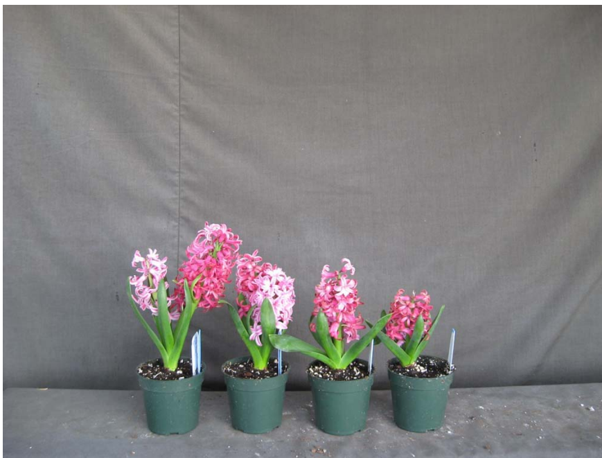
Pink Pearl. Postharvest. Left to right: Control, 40 ppm Topflor dips for 10, 30 or 60 minutes. Expt. 2009-H1, Set 1. Image 1244.