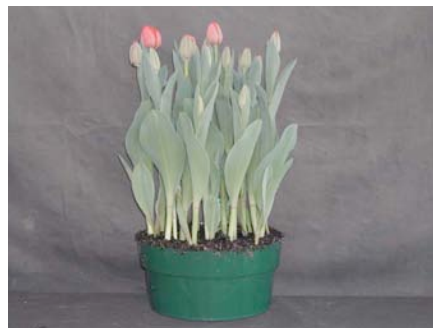
19 wks cold; in grnhse 10 Mar. (3803)