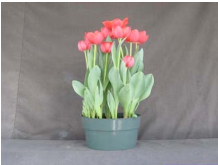
17 wks cold; in grnhse 5 Feb. (0444)