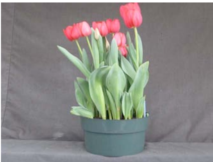
16 wks cold; in grnhse 16 Jan. (0097)