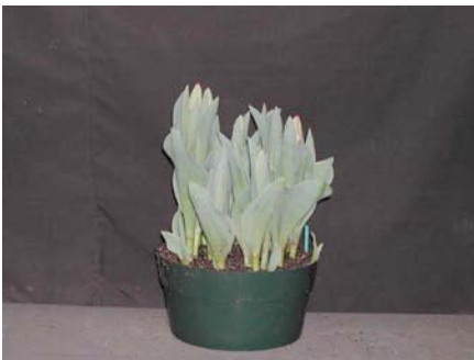
14 wks cold; in grnhse 5 Jan. (1437)