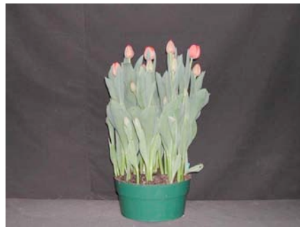
22 wks cold; in grnhse 5 Apr. (1442)