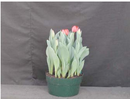
16 wks cold; in grnhse 19 Jan. (0069)