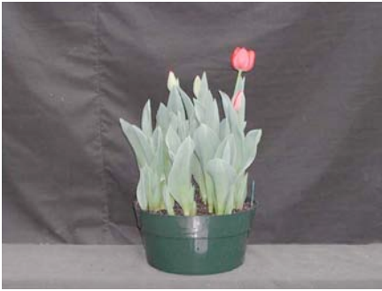
13 wks cold; in grnhse 22 Dec. (1106)