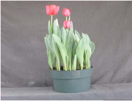
15 wks cold; in grnhse 7 Jan. (0067)