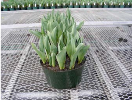
13.5 wks cold; in grnhse 2 Jan. (0374)