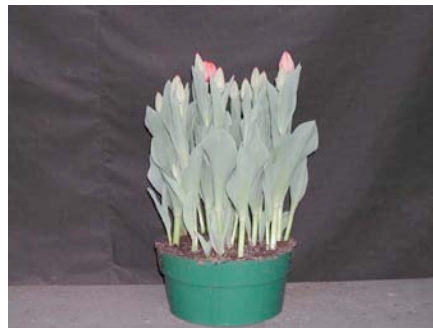
21 wks cold; in grnhse 15 Mar. (1095)