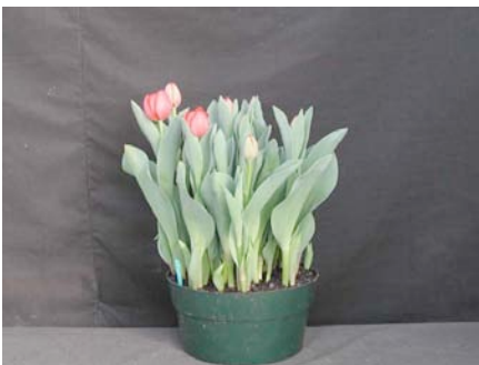
18 wks cold; in grnhse 9 Feb (0576)

Effect of cold-weeks on overall appearance of 'Sevilla' cut tulips. Bulbs were held at 17C until planting. Cold weeks vary between panels from 13-22 weeks. 15 bulbs were planted into a 12" (30 cm) container with MetroMix 360. Experiment 2004-T2.