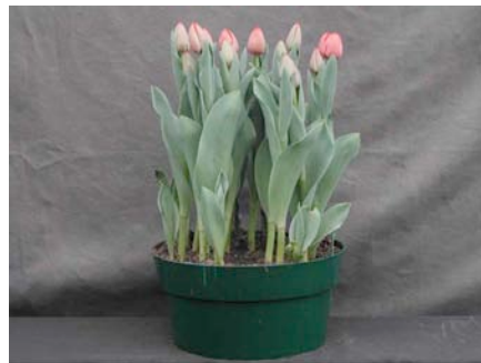
22 wks cold; in grnhse 7 Apr. (4816)