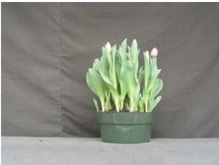
16 wks cold; in grnhse 30 Jan. (1267)