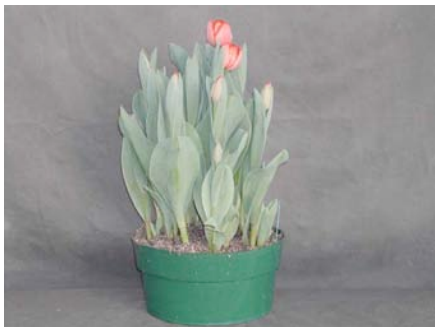
16 wks cold; in grnhse 10 Feb. (3593)