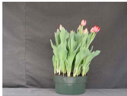
21 wks cold; in grnhse 20 Mar. (2453)