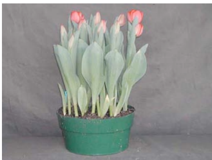
15 wks cold; in grnhse 20 Jan. (3428)