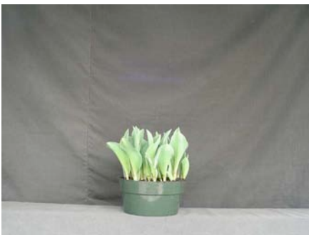
15 wks cold; in grnhse 16 Jan. (0541)