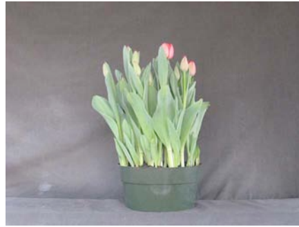
19 wks cold; in grnhse 4 Mar. (0706)