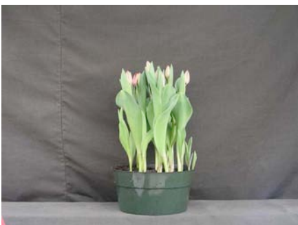
17 wks cold; in grnhse 20 Feb (2028)

Effect of cold-weeks on overall appearance of 'Sevilla' cut tulips. Bulbs were held at 17C until planting. Cold weeks vary between panels from 13.5-23 weeks. 15 bulbs were planted into 10" (30 cm) container with MetroMix 360. Experiment 2006-T2.