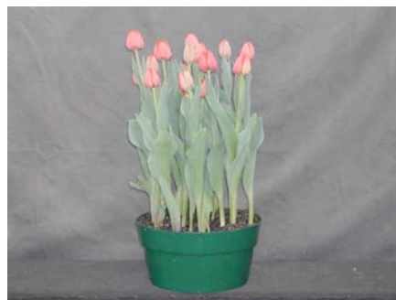
20 wks cold; in grnhse 24 Mar. (4104)