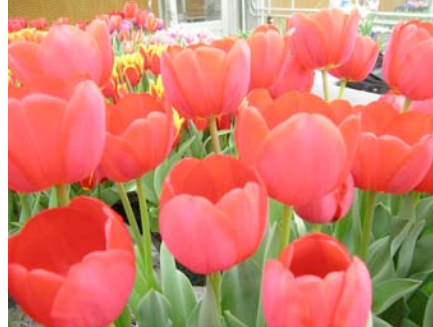
Sevilla flower (5470)