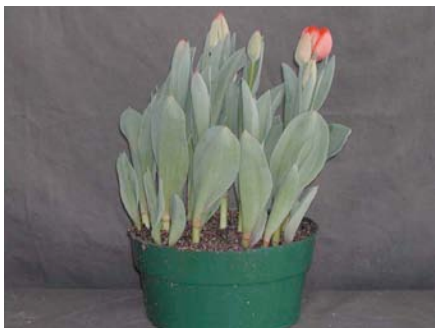
14 wks cold; in grnhse 6 Jan. (3362)