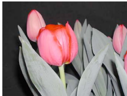
Sevilla flower (0575)