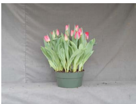
19 wks cold; in grnhse 8 Mar. (2506)

Effect of cold-weeks and PGR drenches on appearance of 6" tulip. Cold duration varies between panels from 16-22 weeks. In each panel, L to R: Control, 1 and 2 mg Bonzi, 0.5 and 1 mg/pot Topflor applied as a soil drench (2-4 days after placing in the greenhouse). 2011.