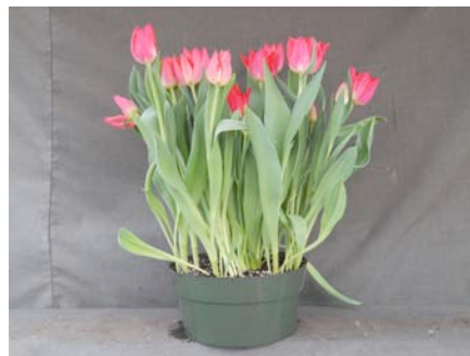
21 wks cold; in grnhse 22 Mar. (2752)