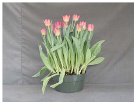
22 wks cold; in grnhse 19 Apr. (3010)