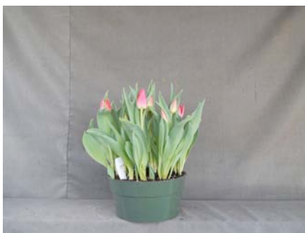
15 wks cold; in grnhse 18 Jan. (1995)