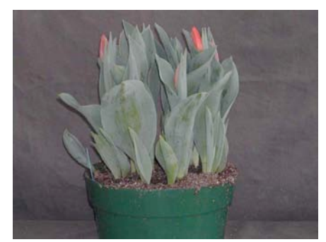
14 wks cold; in grnhse 6 Jan. (3363)