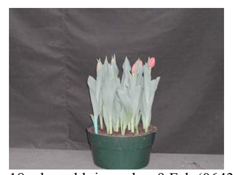
18 wks cold; in grnhse 9 Feb (0643)

Effect of cold-weeks on overall appearance of 'Laura Figi' cut tulips. Bulbs were held at 17C until planting. Cold weeks vary between panels from 13-22 weeks. 15 bulbs were planted into a 12" (30 cm) container with MetroMix 360. Experiment 2004-T2.