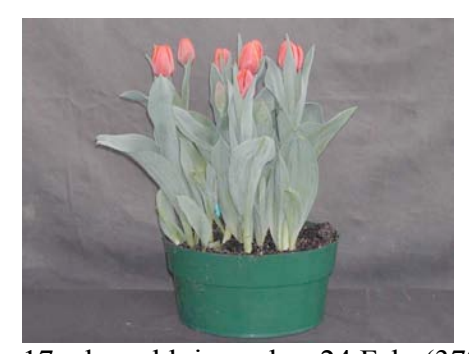
17 wks cold; in grnhse 24 Feb. (3727)

Effect of cold-weeks on overall appearance of 'Laura Figi' cut tulips. Bulbs were held at 17C until planting. Cold weeks vary between panels from 14-22 weeks. 15 bulbs were planted into a 12" (30 cm) container with MetroMix 360. Experiment 2003-T2.