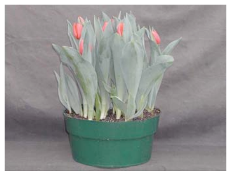
16 wks cold; in grnhse 10 Feb. (3597)