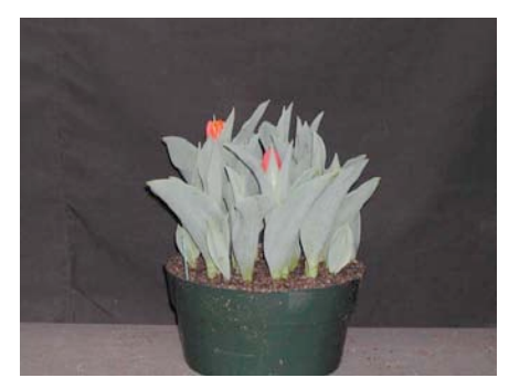
14 wks cold; in grnhse 5 Jan. (1441)