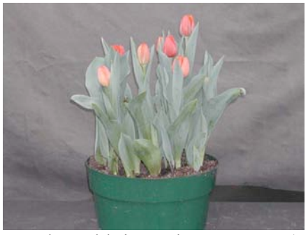
19 wks cold; in grnhse 10 Mar. (3841)