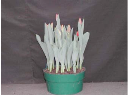
N/A 13 wks cold; in grnhse 22 Dec.