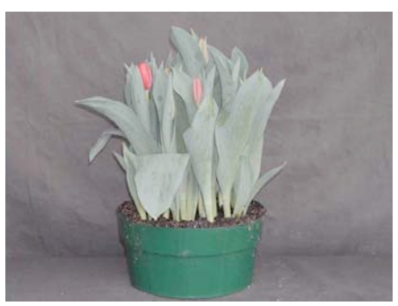
15 wks cold; in grnhse 20 Jan. (3427)