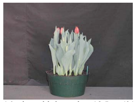
16 wks cold; in grnhse 19 Jan. (0117)