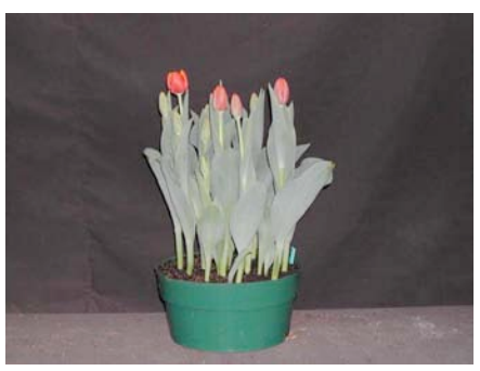
21 wks cold; in grnhse 15 Mar. (1124)