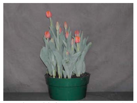
22 wks cold; in grnhse 7 Apr. (4999)