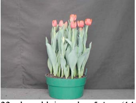
22 wks cold; in grnhse 5 Apr. (1463)