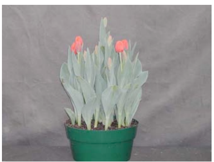
20 wks cold; in grnhse 24 Mar. (4101)