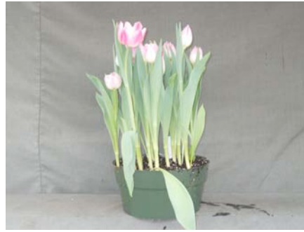
21 wks cold; in grnhse 22 Mar. (2768)