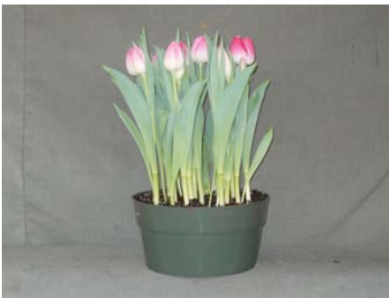
19 wks cold; in grnhse 8 Mar. (2535)

Effect of cold-weeks and PGR drenches on appearance of 6" tulip. Cold duration varies between panels from 16-22 weeks. In each panel, L to R: Control, 1 and 2 mg Bonzi, 0.5 and 1 mg/pot Topflor applied as a soil drench (2-4 days after placing in the greenhouse). 2011.