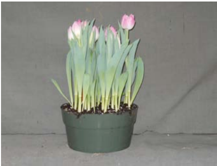
18wks cold; in grnhse 22 Feb. (2321)