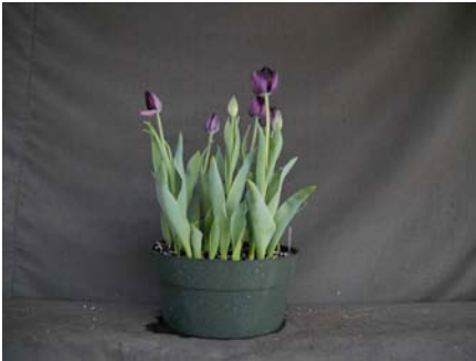
17 wks cold; in grnhse 2 Feb. (0467)