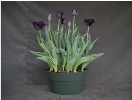
16 wks cold; in grnhse 25 Jan. (0463)