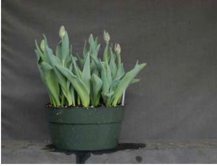
15 wks cold; in grnhse 12 Jan. (0303)