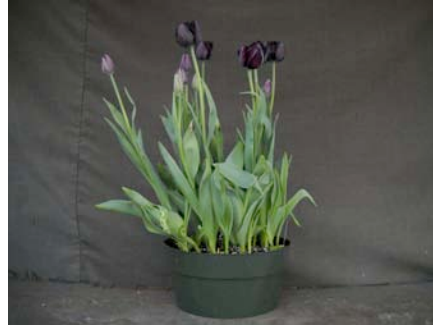
19 wks cold; in grnhse 2 March (0675)