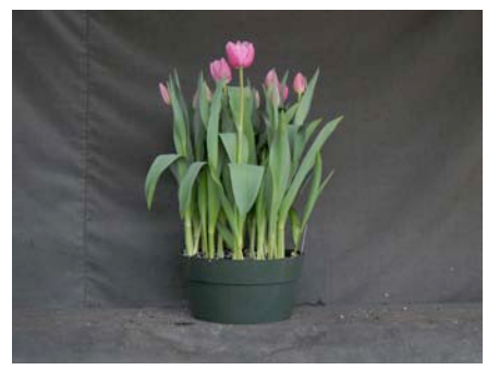
17 wks cold; in grnhse 2 Feb. (0347)