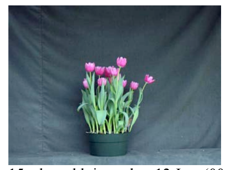
15 wks cold; in grnhse 12 Jan. (0059)