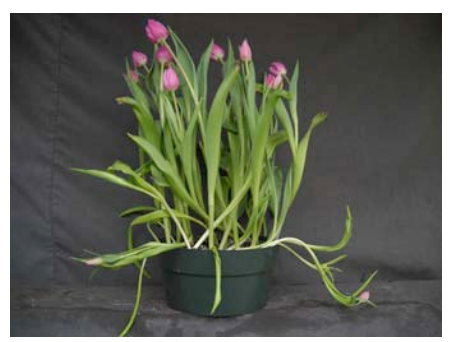
21 wks cold; in grnhse 16 March (0749)