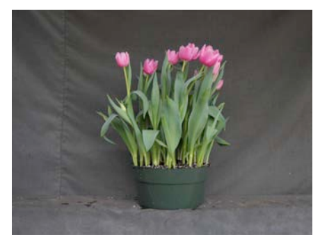
16 wks cold; in grnhse 25 Jan. (0300)