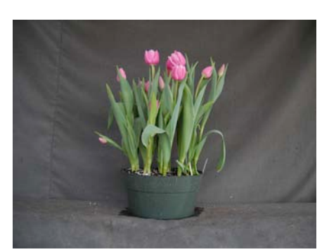
18 wks cold; in grnhse 16 Feb. (0468)

Effect of cold-weeks on overall appearance of 'Bergamo' fresh cut tulips. Bulbs were held at 17C until planting. Cold weeks vary between panels from 15-23 weeks. 15 bulbs were planted into 10" (30 cm) container with Sunshine LC-8 mix. Experiment 2010-T2.