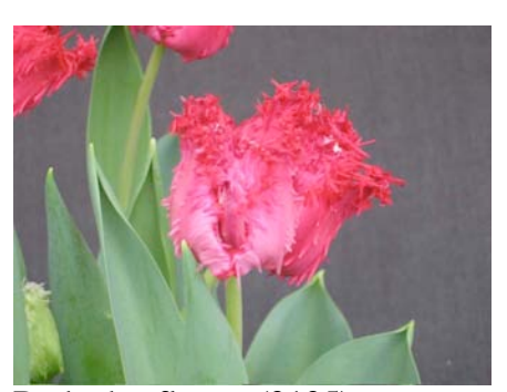
Barbados flower (0135)