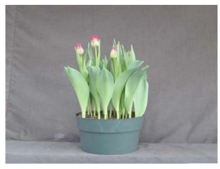
15 wks cold; in grnhse 7 Jan. (0091)