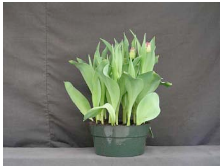
17 wks cold; in grnhse 20 Feb (2030)

Effect of cold-weeks on overall appearance of 'Barbados' cut tulips. Bulbs were held at 17C until planting. Cold weeks vary between panels from 13.5-23 weeks. 15 bulbs were planted into 10" (30 cm) container with MetroMix 360. Experiment 2006-T2.