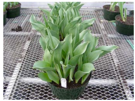
13.5 wks cold; in grnhse 2 Jan. (0366)