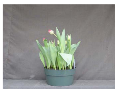
16 wks cold; in grnhse 16 Jan. (0119)