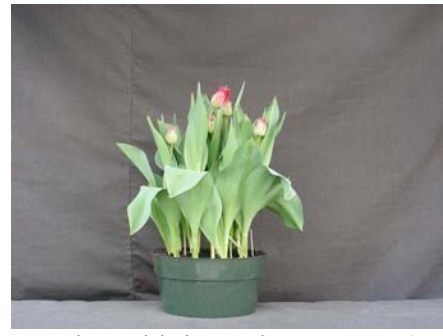
19 wks cold; in grnhse 6 Mar. (2331)