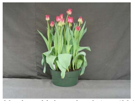
23 wks cold; in grnhse 3 Apr. (2965)