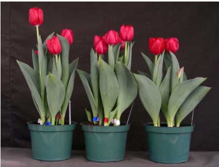
15 wks cold; in grnhse 23 Jan. (0685)