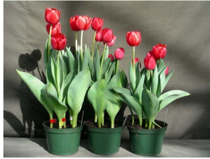
17 wks cold; in grnhse 27 Feb. (2102)