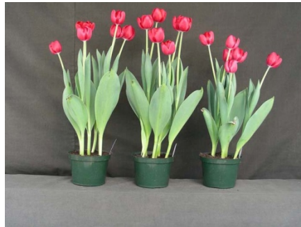
23 wks cold; in grnhse 10 Apr. (2979)

Effect of cold-weeks and paclobutrazol (Piccolo) drenches on appearance of 6" 'Zorro' tulips. Cold duration varies between panels from 13-24 weeks. In each panel, L to R: Control, 1 and 2 mg Piccolo applied as a soil drench 1-3 days after placing in the greenhouse. Experiment 2006-T1.