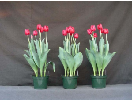
16 wks cold; in grnhse 13 Feb (1745)