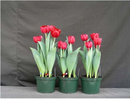
14 wks cold; in grnhse 9 Jan. (0430)