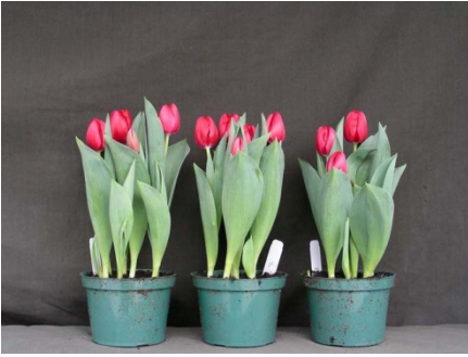
13 wks cold; in grnhse 26 Dec. (0286)