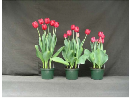
19 wks cold; in grnhse 13 Mar. (2386)