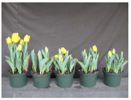
16 wks cold; in grnhse 20 Jan. (1133)