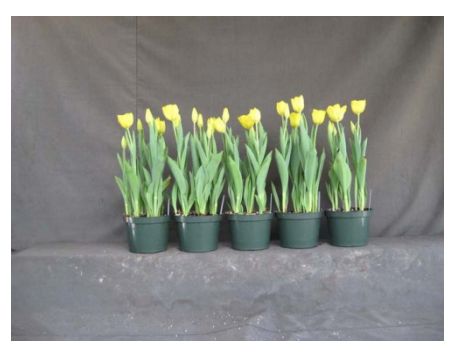
21 wks cold; in grnhse 24 Mar. (2049)