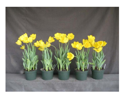
18 wks cold; in grnhse 24 Feb. (1521)

Effect of cold-weeks and paclobutrazol (Piccolo) drenches on appearance of 6" 'Yellow Star' tulips. Cold duration varies between panels from 14-23 weeks. In each panel, L to R: Control, 1 and 2 mg Piccolo, 0.5 and 1 mg/pot Topflor applied as a soil drench (2-7 days after placing in the greenhouse).