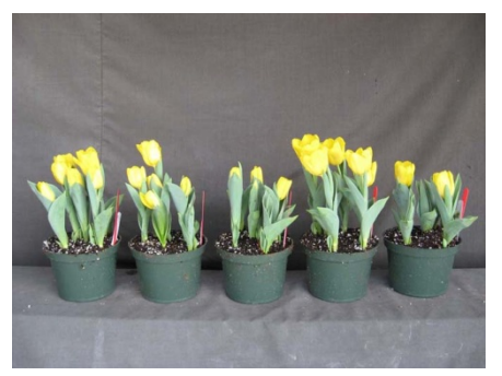
14 wks cold; in grnhse 6 Jan. (0843)