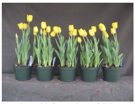
19 wks cold; in grnhse 10 Mar. (1856)