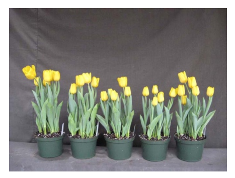
17 wks cold; in grnhse 3 Feb Jan. (1346)