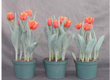
17 wks cold; in grnhse 3 Mar. (3766)