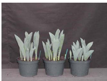
14 wks cold; in grnhse 5 Jan. (1527)