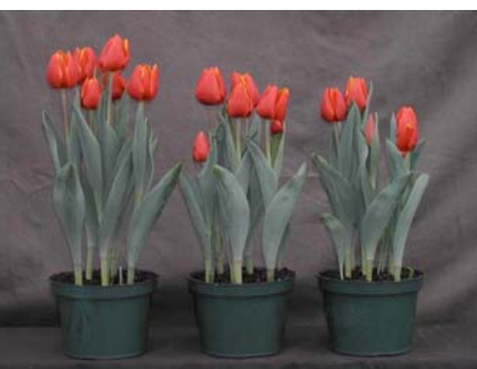
21 wks cold; in grnhse 31 Mar. (4795)