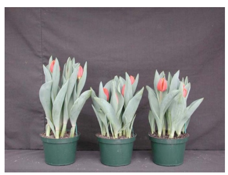
17 wks cold; in grnhse 28 Feb. (9909)