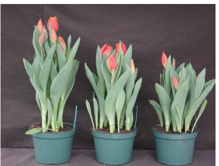
23 wks cold; in grnhse 11 Apr. (9646) Effect of cold-weeks and paclobutrazol (Piccolo) drenches on appearance of 6" 'King's Cloak' tulips. Cold duration varies between panels from 12-24 weeks. In each panel, L to R: Control, 1 and 2 mg Piccolo applied as a soil drench 1-3 days after placing in the greenhouse.