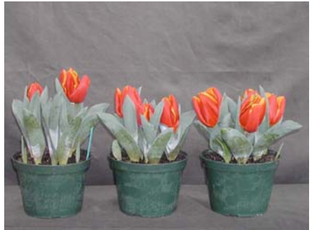
12 wks cold; in grnhse 23 Dec. (3392)