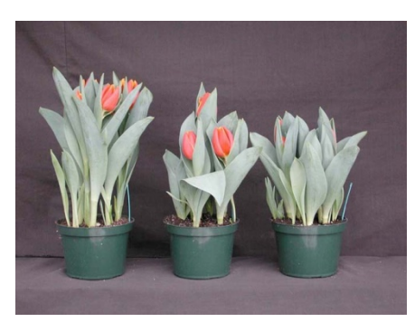
15 wks cold; in grnhse 25 Jan. (9591)