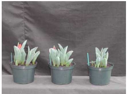
12 wks cold; in grnhse 15 Dec. (1104)