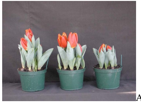
12 wks cold; in grnhse 20 Dec. (9467)