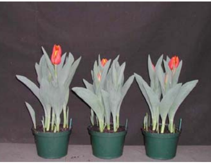
18 wks cold; in grnhse 8 Mar. (1061)