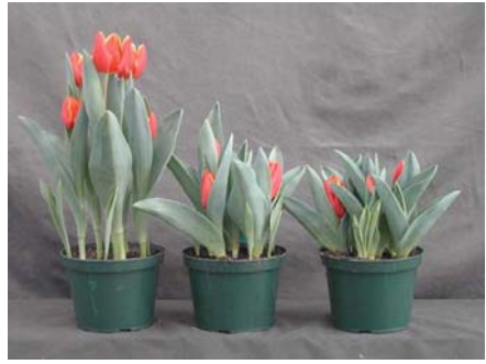
16 wks cold; in grnhse 27 Jan. (3515)