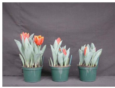
14 wks cold; in grnhse 10 Jan. (9559)