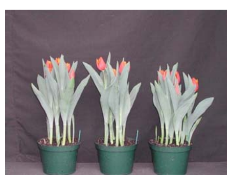
20 wks cold; in grnhse 22 Mar. (1318)