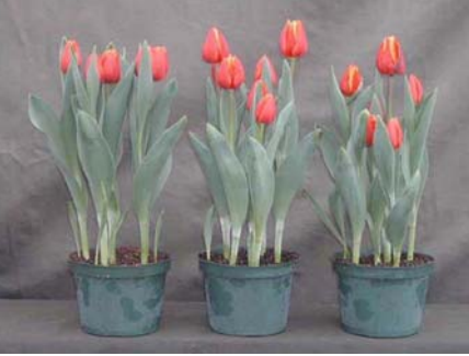
19 wks cold; in grnhse 17 Mar. (4024)