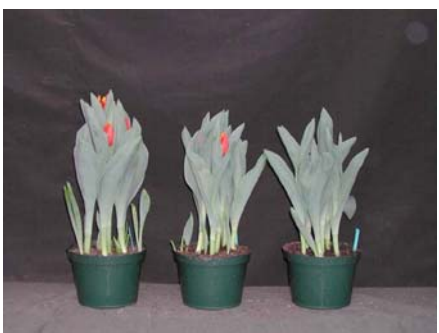
16 wks cold; in grnhse 23 Feb. (0761)

17 wks cold; in grnhse 2 Feb (0377)22 wks cold; in grnhse 12 Apr. (1502)Effect of cold-weeks and Bonzi drenches on appearance of 6" 'King's Cloak' tulips. Coldweeks vary between panels from 12-24 weeks. In each panel, L to R: Control, 1 and 2 mgBonzi applied as a soil drench 1-2 days after placing in the greenhouse. 2004.