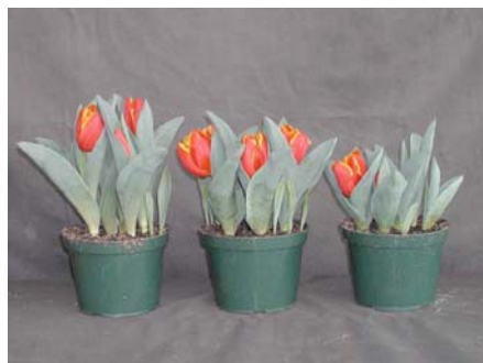
14 wks cold; in grnhse 13 Jan. (3446)