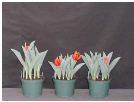
15 wks cold; in grnhse 19 Jan. (0123)