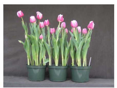
14.5 wks cold; in grnhse 7 Jan. (xxx)