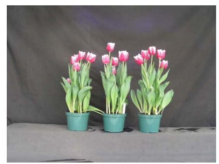
15 wks cold; in grnhse 23 Jan. (0564)