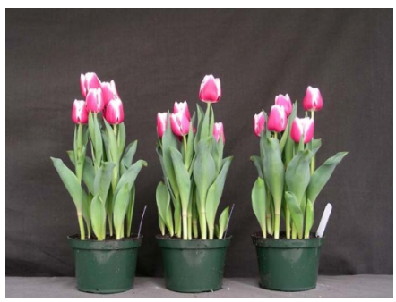
14 wks cold; in grnhse 9 Jan. (0253)