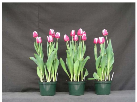
N/A 13 wks cold; in grnhse 26 Dec. (xxx)