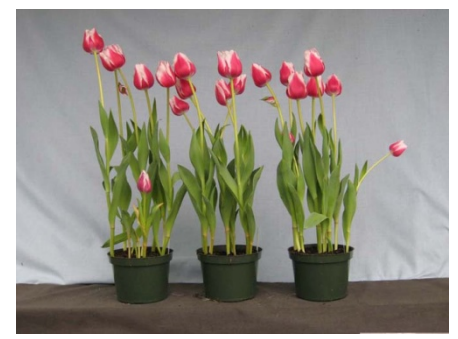
16 wks cold; in grnhse 22 Jan. (0038)