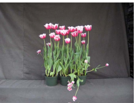
23 wks cold; in grnhse 16 Mar. (0786)