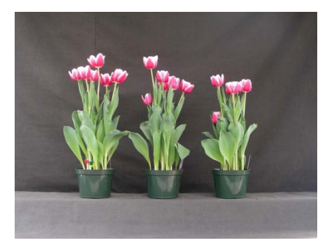
N/A 21 wks cold; in grnhse 27 Mar. (xxx)