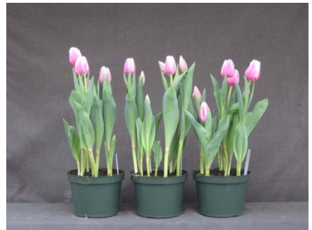
17 wks cold; in grnhse 5 Feb Jan. (0141)