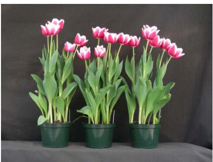
19 wks cold; in grnhse 13 Mar. (2249)