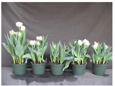
14 wks cold; in grnhse 6 Jan. (1220)