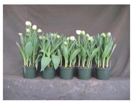
21 wks cold; in grnhse 24 Mar. (2111)