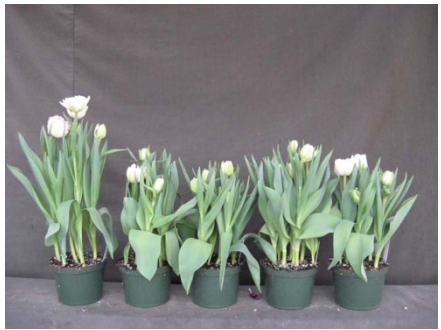
17 wks cold; in grnhse 3 Feb Jan. (1458)