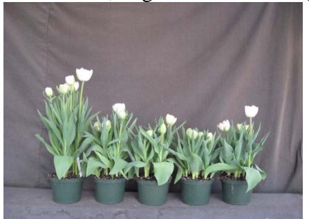
18 wks cold; in grnhse 24 Feb. (1630)

Effect of cold-weeks and paclobutrazol (Piccolo) drenches on appearance of 6" 'Finola' tulips. Cold duration varies between panels from 14-23 weeks. In each panel, L to R: Control, 1 and 2 mg Piccolo, 0.5 and 1 mg/pot Topflor applied as a soil drench (2-7 days after placing in the greenhouse).