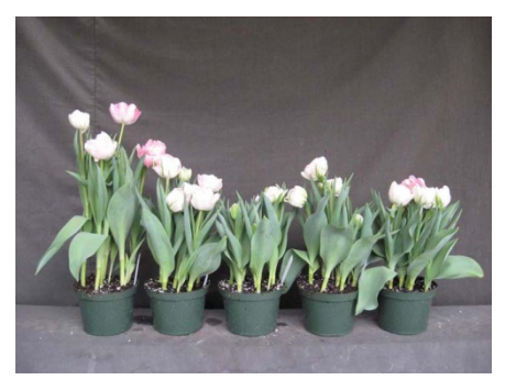
16 wks cold; in grnhse 20 Jan. (1330)