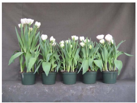
19 wks cold; in grnhse 10 Mar. (2042)