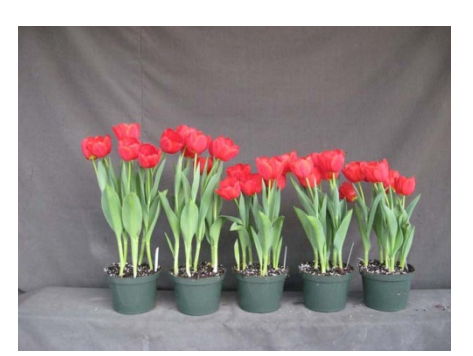
18 wks cold; in grnhse 24 Feb. (1518)

Effect of cold-weeks and paclobutrazol (Piccolo) drenches on appearance of 6" 'Carreria' tulips. Cold duration varies between panels from 14-23 weeks. In each panel, L to R: Control, 1 and 2 mg Piccolo, 0.5 and 1 mg/pot Topflor applied as a soil drench (2-7 days after placing in the greenhouse).