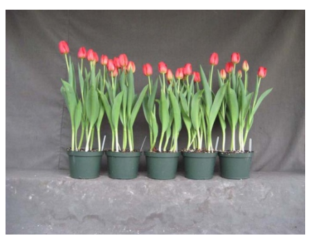
21 wks cold; in grnhse 24 Mar. (2067)