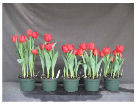
16 wks cold; in grnhse 20 Jan. (1228)