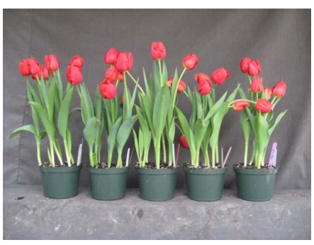
19 wks cold; in grnhse 10 Mar. (1953)