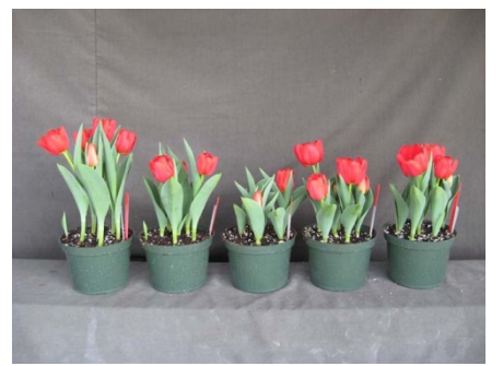
14 wks cold; in grnhse 6 Jan. (0935)