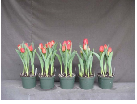
17 wks cold; in grnhse 3 Feb Jan. (1338)