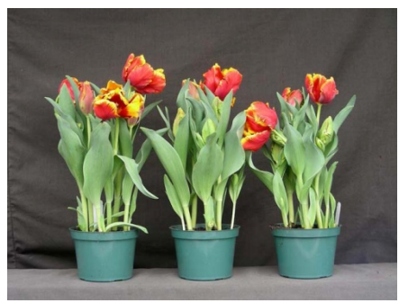
13 wks cold; in grnhse 26 Dec. (0341)