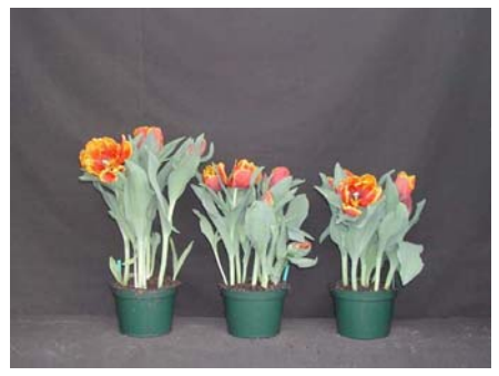
20 wks cold; in grnhse 22 Mar. (1294)