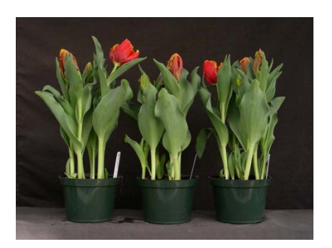
15 wks cold; in grnhse 23 Jan. (0687)