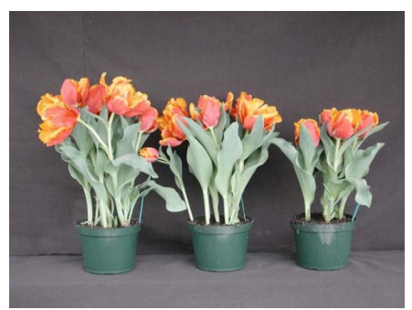
14 wks cold; in grnhse 10 Jan. (9492)