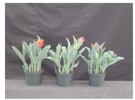
14 wks cold; in grnhse 5 Jan. (1266)