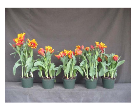
18 wks cold; in grnhse 24 Feb. (1508)

Effect of cold-weeks and paclobutrazol (Piccolo) drenches on appearance of 6" 'Bright Parrot' tulips. Cold duration varies between panels from 14-23 weeks. In each panel, L to R: Control, 1 and 2 mg Piccolo, 0.5 and 1 mg/pot Topflor applied as a soil drench (2-7 days after placing in the greenhouse).