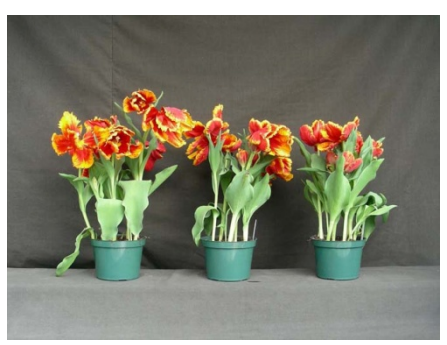
19 wks cold; in grnhse 13 Mar. (2415)