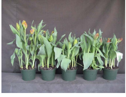
17 wks cold; in grnhse 3 Feb Jan. (1376)