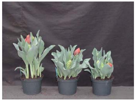
15 wks cold; in grnhse 19 Jan. (0011)