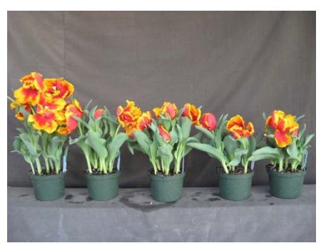
14 wks cold; in grnhse 6 Jan. (1050)