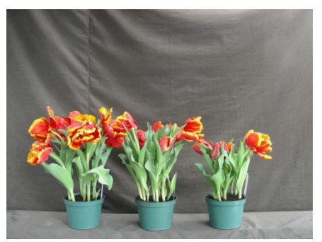
15 wks cold; in grnhse 15 Jan. (0085)