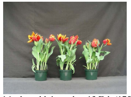
16 wks cold; in grnhse 13 Feb (1751)