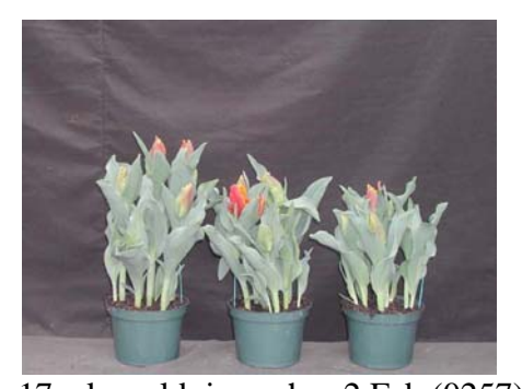
17 wks cold; in grnhse 2 Feb (0257)