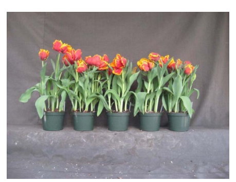
21 wks cold; in grnhse 24 Mar. (2079)