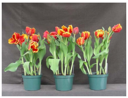
21 wks cold; in grnhse 26 Mar. (1316)