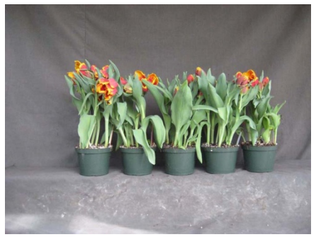
19 wks cold; in grnhse 10 Mar. (2016)