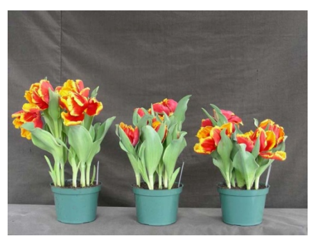
14 wks cold; in grnhse 2 Jan. (0038)