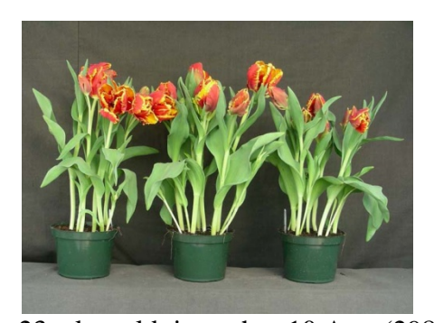
23 wks cold; in grnhse 10 Apr. (2984)

Effect of cold-weeks and paclobutrazol (Piccolo) drenches on appearance of 6" 'Bright Parrot' tulips. Cold duration varies between panels from 13-24 weeks. In each panel, L to R: Control, 1 and 2 mg Piccolo applied as a soil drench 1-3 days after placing in the greenhouse. Experiment 2006-T1.