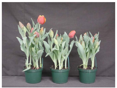
17 wks cold; in grnhse 28 Feb. (9866)