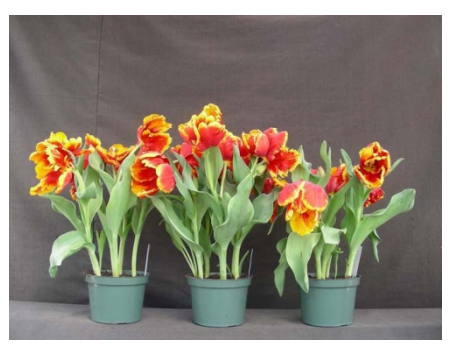
19 wks cold; in grnhse 12 Mar. (0404)