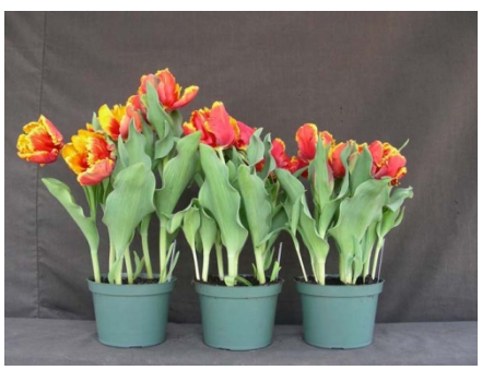
17 wks cold; in grnhse 26 Feb. (0342)