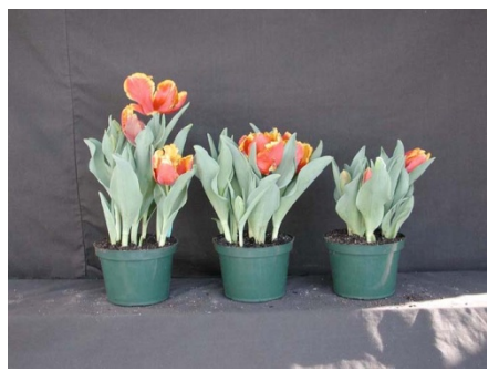
12 wks cold; in grnhse 20 Dec. (9325)