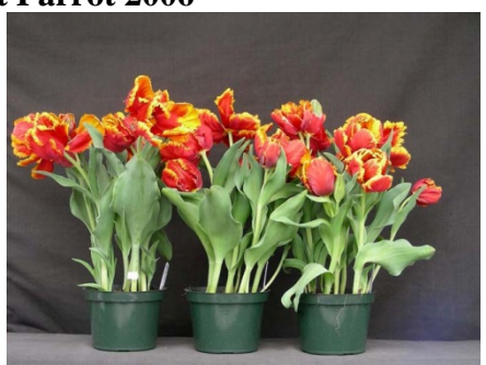
17 wks cold; in grnhse 27 Feb. (2136)