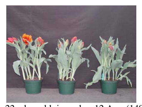
22 wks cold; in grnhse 12 Apr. (1495)

Effect of cold-weeks and Bonzi drenches on appearance of 6" 'Bright Parrot' tulips. Cold weeks vary between panels from 12-24 weeks. In each panel, L to R: Control, 1 and 2 mg Bonzi applied as a soil drench 1-2 days after placing in the greenhouse. 2004.