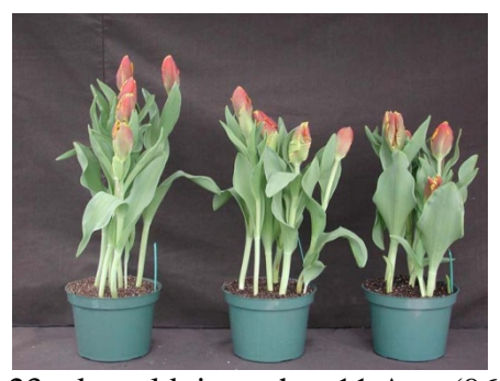
23 wks cold; in grnhse 11 Apr. (9644) Effect of cold-weeks and paclobutrazol (Piccolo) drenches on appearance of 6" 'Bright Parrot' tulips. Cold duration varies between panels from 12-24 weeks. In each panel, L to R: Control, 1 and 2 mg Piccolo applied as a soil drench 1-3 days after placing in the greenhouse.