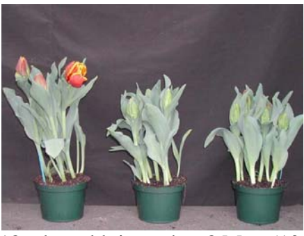
18 wks cold; in grnhse 8 Mar. (1031)