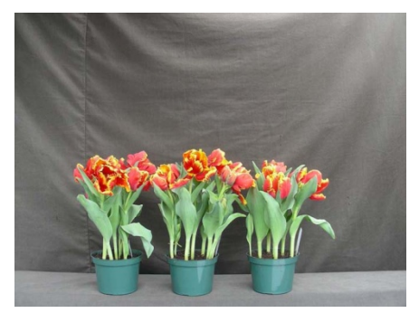
17 wks cold; in grnhse 12 Feb (0232)

N/A 23 wks cold; in grnhse 16 Apr. (xxx)