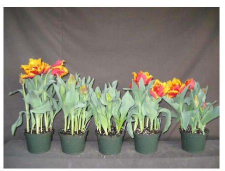
16 wks cold; in grnhse 20 Jan. (1200)