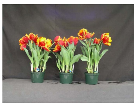
14 wks cold; in grnhse 9 Jan. (0559)