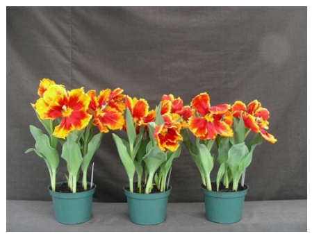
16 wks cold; in grnhse 29 Jan. (0200)