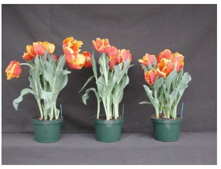
15 wks cold; in grnhse 25 Jan. (9587)