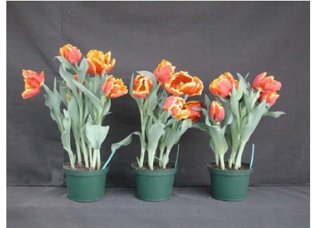
16 wks cold; in grnhse 14 Feb (9791)