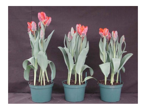
23 wks cold; in grnhse 11 Apr. (9648)

Effect of cold-weeks and paclobutrazol (Piccolo) drenches on appearance of 6" 'Blumex' tulips. Cold duration varies between panels from 12-24 weeks. In each panel, L to R: Control, 1 and 2 mg Piccolo applied as a soil drench 1-3 days after placing in the greenhouse.