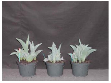
15 wks cold; in grnhse 19 Jan. (0009)