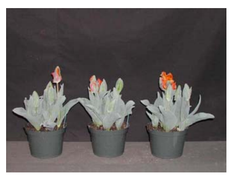
12 wks cold; in grnhse 15 Dec. (1219)