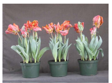
14.5 wks cold; in grnhse 7 Jan. (0064)