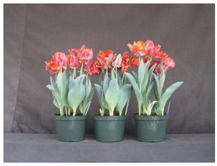
17 wks cold; in grnhse 5 Feb Jan. (0439)