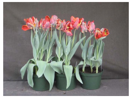
23 wks cold; in grnhse 16 Mar. (0799)