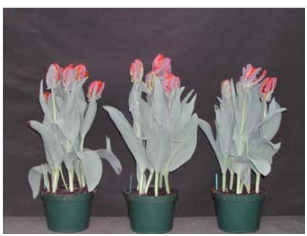
N/A 17 wks cold; in grnhse 2 Feb (xxx) 22 wks cold; in grnhse 12 Apr. (1493) Effect of cold-weeks and Bonzi drenches on appearance of 6" 'Blumex' tulips. Cold weeks vary between panels from 12-24 weeks. In each panel, L to R: Control, 1 and 2 mg Bonzi applied as a soil drench 1-2 days after placing in the greenhouse. 2004.