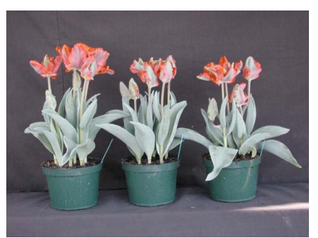
12 wks cold; in grnhse 20 Dec. (9468)