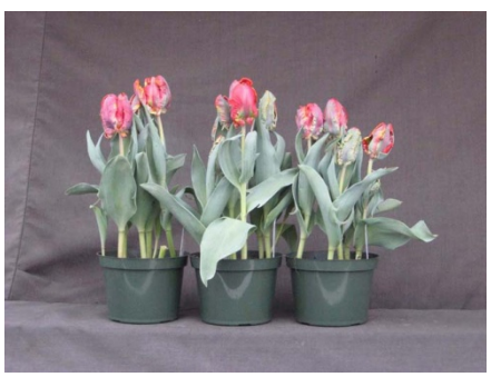
19 wks cold; in grnhse 11 Mar. (0713)