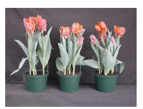
16 wks cold; in grnhse 14 Feb (9790)