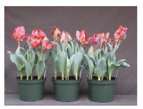
16 wks cold; in grnhse 22 Jan. (0116)