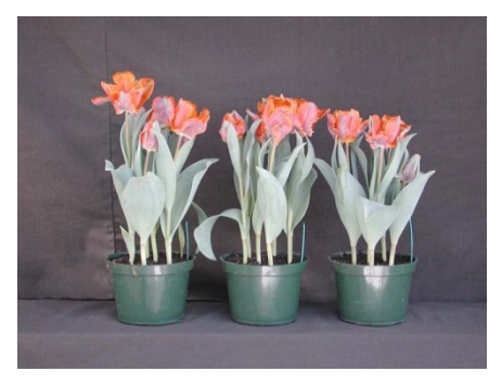
15 wks cold; in grnhse 25 Jan. (9604)