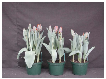
17 wks cold; in grnhse 28 Feb. (9908)