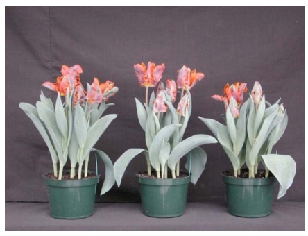
14 wks cold; in grnhse 10 Jan. (9561)