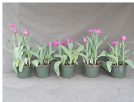
22 wks cold; in grnhse 12 Apr. (2977)