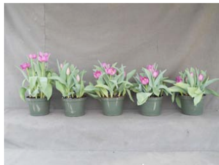
20 wks cold; in grnhse 29 Mar. (2914)