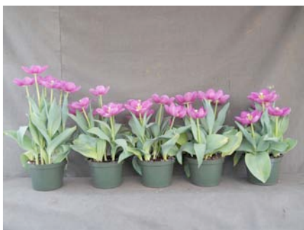
18 wks cold; in grnhse 15 Mar. (2733)

Effect of cold-weeks and PGR drenches on appearance of 6" tulip. Cold duration varies between panels from 16-22 weeks. In each panel, L to R: Control, 1 and 2 mg Bonzi, 0.5 and 1 mg/pot Topflor applied as a soil drench (2-4 days after placing in the greenhouse). 2011.