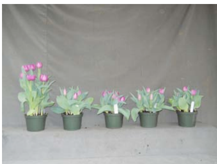
17 wks cold; in grnhse 1 Mar. (2477)