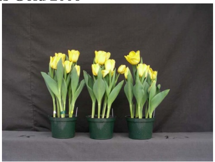
17 wks cold; in grnhse 27 Feb. (1945)