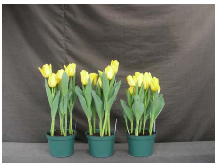
N/A 17 wks cold; in grnhse 12 Feb (0215) 23 wks cold; in grnhse 16 Apr. (xxx) Effect of cold-weeks and paclobutrazol (Piccolo) drenches on appearance of 6" 'Agrass Gold' tulips. Cold duration varies between panels from 14-23 weeks. In each panel, L to R: Control, 1 and 2 mg Piccolo applied as a soil drench 4-6 days after placing in the greenhouse.