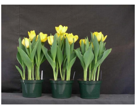
19 wks cold; in grnhse 13 Mar. (2254)