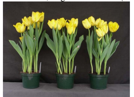
23 wks cold; in grnhse 10 Apr. (2969)

Effect of cold-weeks and paclobutrazol (Piccolo) drenches on appearance of 6" 'Agrass Gold' tulips. Cold duration varies between panels from 13-24 weeks. In each panel, L to R: Control, 1 and 2 mg Piccolo applied as a soil drench 1-3 days after placing in the greenhouse. Experiment 2006-T1.