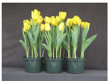
N/A 14.5 wks cold; in grnhse 7 Jan. (xxx)