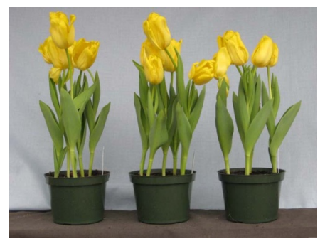
16 wks cold; in grnhse 22 Jan. (0037)