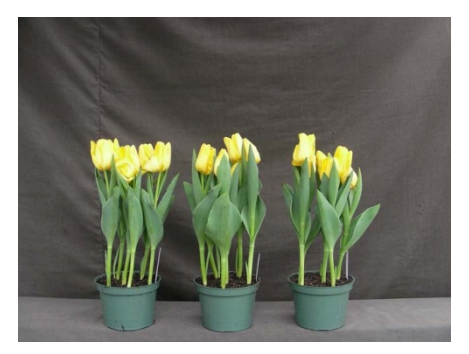
N/A 14 wks cold; in grnhse 2 Jan. (xxx)