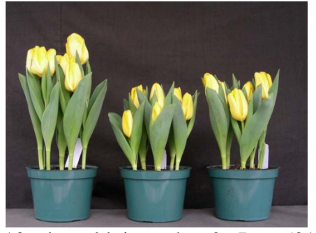
13 wks cold; in grnhse 26 Dec. (0166)