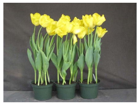
N/A 17 wks cold; in grnhse 5 Feb Jan. (xxx)