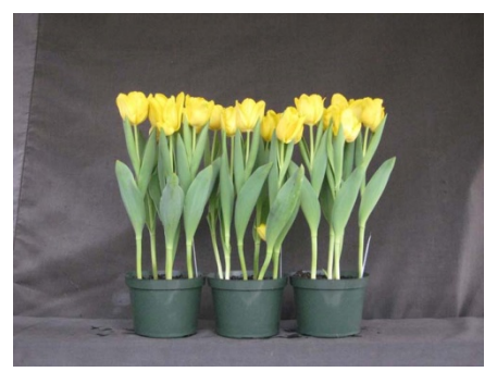
21 wks cold; in grnhse 25 Mar. (0747)