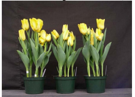
16 wks cold; in grnhse 13 Feb (1615)