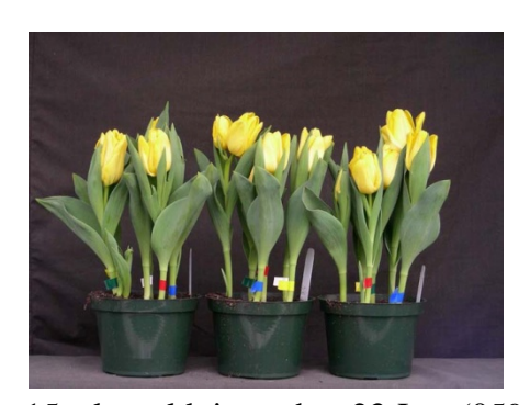
15 wks cold; in grnhse 23 Jan. (0591)