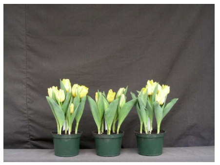
14 wks cold; in grnhse 9 Jan. (0338)